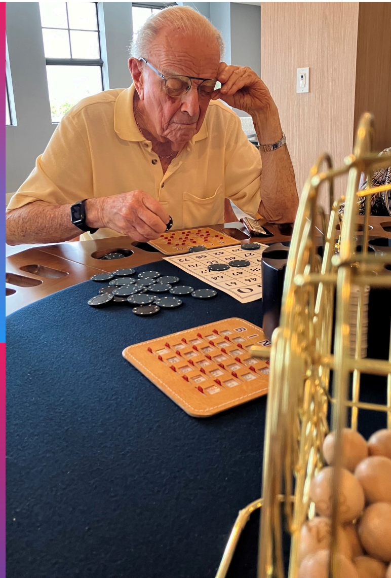
Serious Bingo playing!